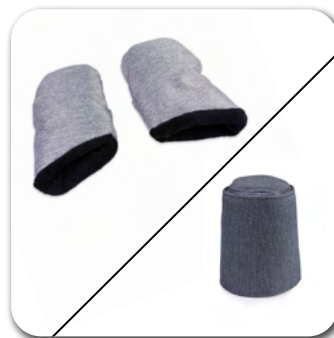
WINTER GLOVES & WEDGE