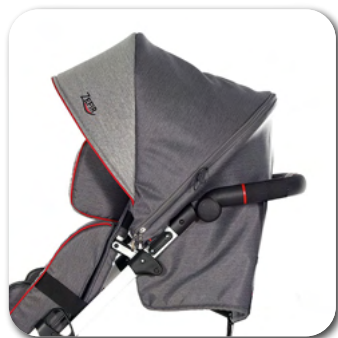
CANOPY WITH WINDOW