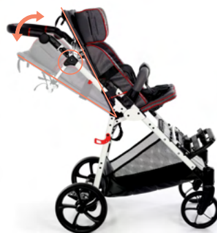
BACKREST ANGLE ADJUSTMENT