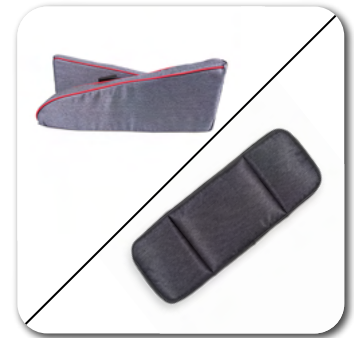
INSERTS AND CUSHION