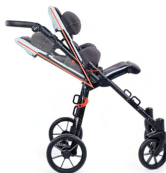
BACKREST ANGLE ADJUSTMENT