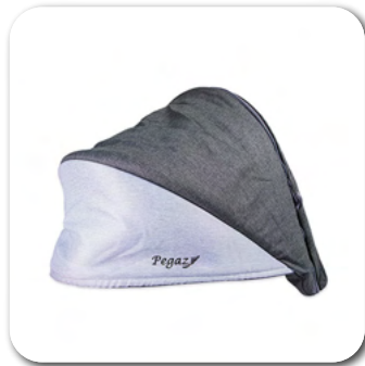
CANOPY WITH WINDOW