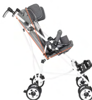
BACKREST ANGLE ADJUSTMENT