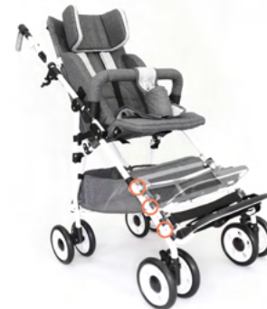
FOOTREST HEIGHT ADJUSTMENT