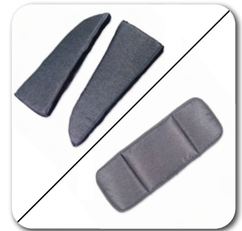
INSERTS AND CUSHIONS