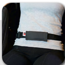
TWO POINT BELT - HIPS

Used with less stable patients. Belt fastening system is covered with soft material to enhance user's comfort.