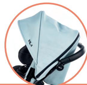
CANOPY WITH WINDOW