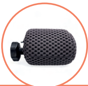
ADJUSTABLE ABDUCTION BLOCK