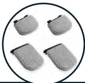
HEAD/TORSO ADJUSTABLE PADS