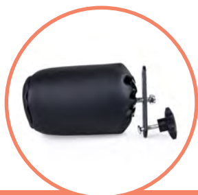
ADJUSTABLE ABDUCTION BLOCK