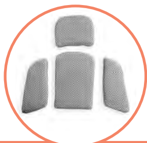
SET MINIMIZING KIT