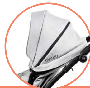
CANOPY WITH WINDOW