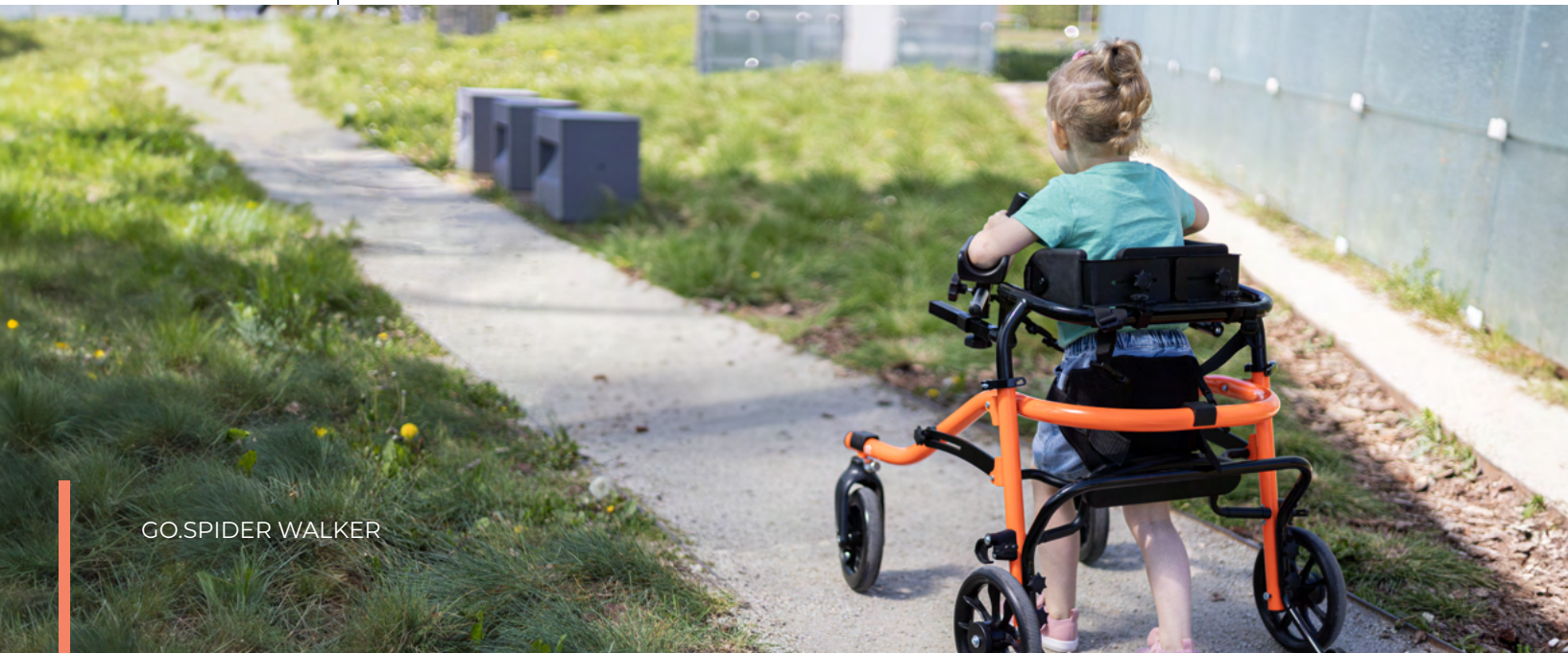
STRAIGHT SUPPORT HANDLES