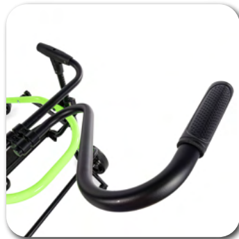
ATTENDANT GUIDE BAR