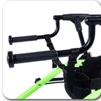
ROTATING SUPPORT HANDLES