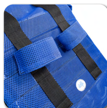
LEG STABILIZING BELTS