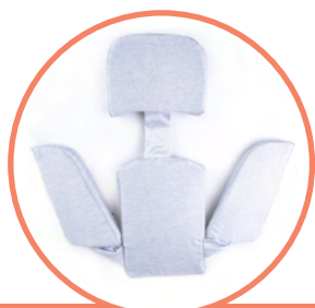
SET MINIMIZING KIT