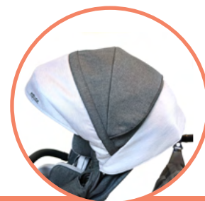
CANOPY WITH WINDOW