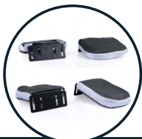
HEAD/TORSO ADJUSTABLE PADS