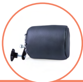
ADJUSTABLE ABDUCTION BLOCK