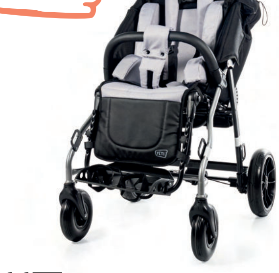
CEMD MEDICAL DEVICE - CLASS I