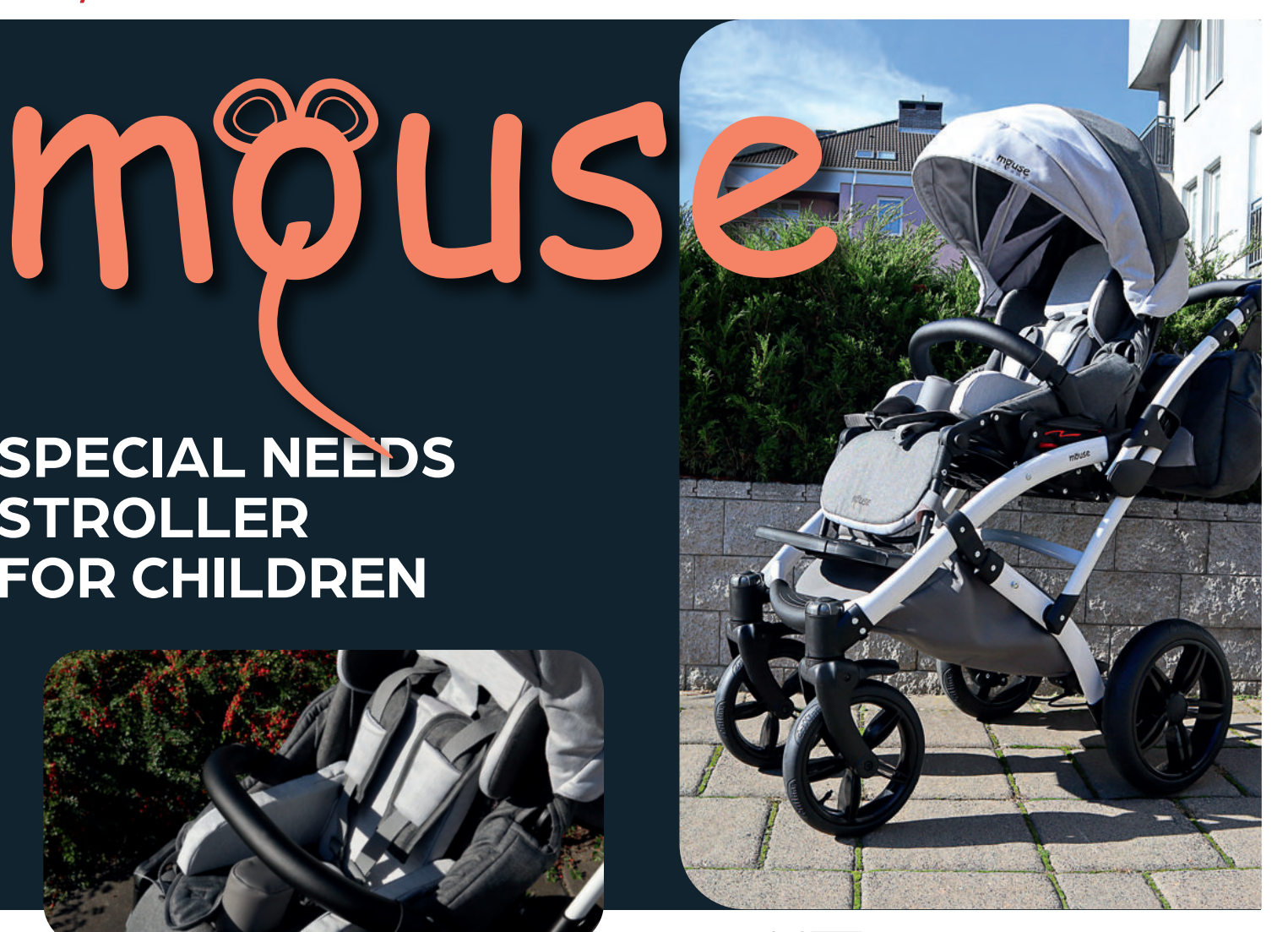
CEMD MEDICAL DEVICE - CLASS I