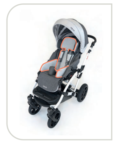
The seat minimizing kit in Mouse is a comfortable, one-peace insert that allows you to reduce both width and depth of the seat.