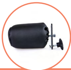
ADJUSTABLE ABDUCTION BLOCK