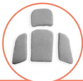
SET MINIMIZING KIT