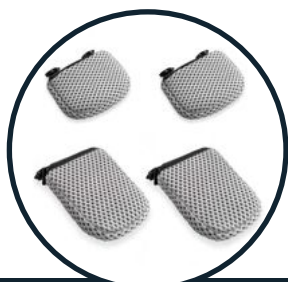
HEAD/TORSO ADJUSTABLE PADS