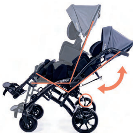
TILT IN SPACE SEAT