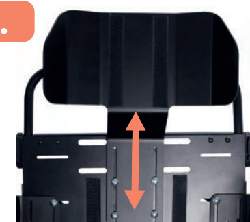
HEIGHT ADJUSTABLE HEADREST