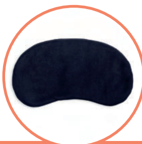
STABILO HEADREST CUSHION