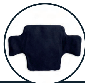
STABILO BACKREST CUSHION