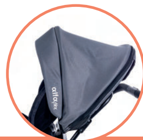
CANOPY WITH WINDOW