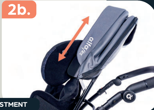
BACKREST HEIGHT ADJUSTMENT