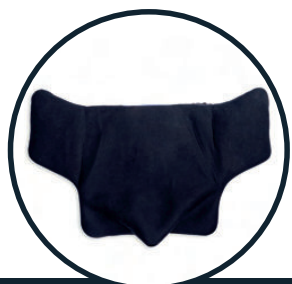
STABILO SEAT CUSHION WITH WEDGE