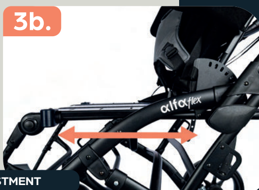
SEAT DEPTH ADJUSTMENT