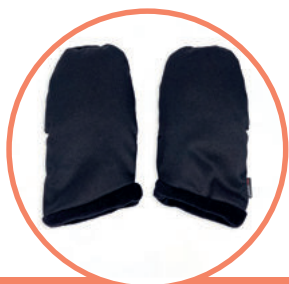
MAGNETIC WINTER GLOVES