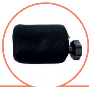
ADJUSTABLE ABDUCTION BLOCK