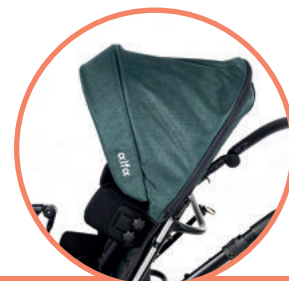
CANOPY WITH WINDOW