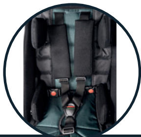
ADJUSTABLE LATERAL AND PELVIC PADS