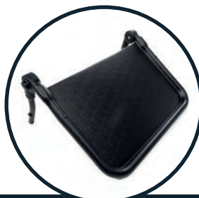
ANGLE ADJUSTABLE THERAPY TRAY