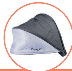
CANOPY WITH WINDOW