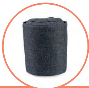
ADJUSTABLE ABDUCTION BLOCK