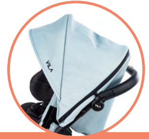
CANOPY WITH WINDOW