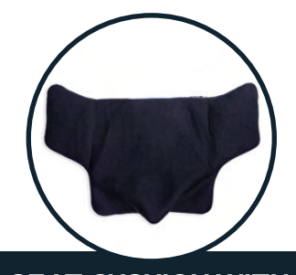
SEAT CUSHION WITH WEDGE