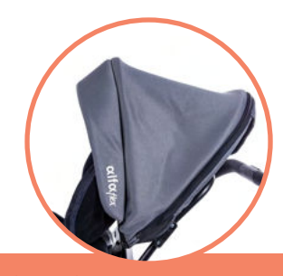
CANOPY WITH WINDOW