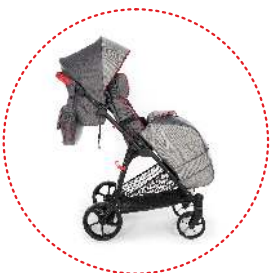
winter sleeping bag