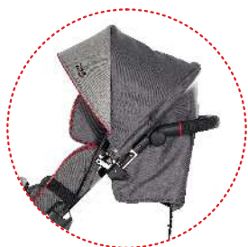
big canopy with window