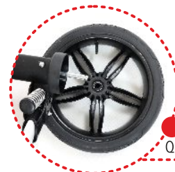
Quick release mount on all 4 wheels