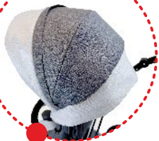
Canopy with window torso / head pads