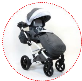
winter sleeping bag