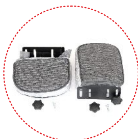
head / torso adjustable pads