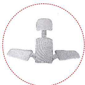
seat minimizing kit