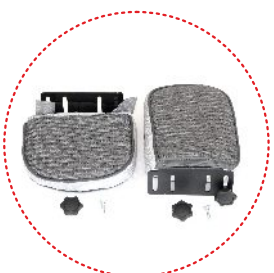
head / torso adjustable pads