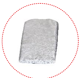
seat minimizing kit