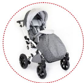
winter sleeping bag