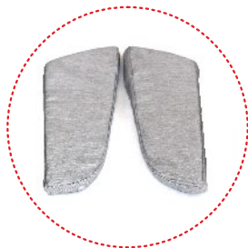
seat minimizing kit