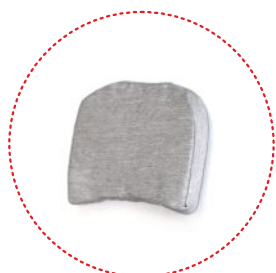
seat minimizing kit