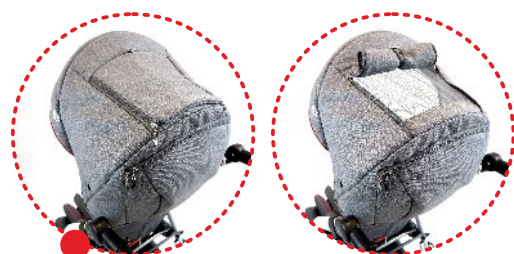
Canopy with window