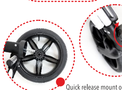
Swivel front castor wheels with option to lock