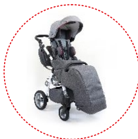
winter sleeping bag