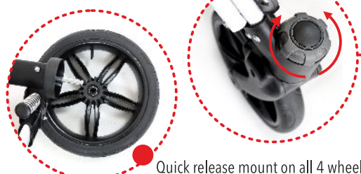
Quick release mount on all 4 wheels