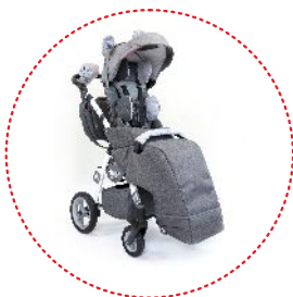
GRIZZLY BEAR set