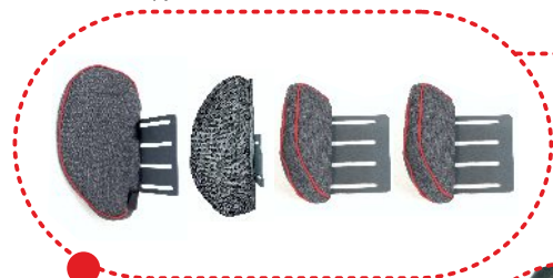
hips / side / torso / head pads