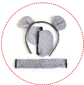
GRIZZLY BEAR set