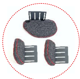
head / torso / hips adjustable pads