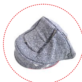
canopy with window