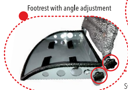
Footrest with angle adjustment