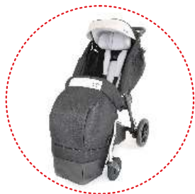
winter sleeping bag