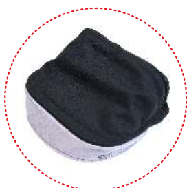
canopy with window