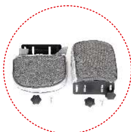
head / torso adjustable pads