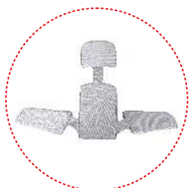
seat minimizing kit