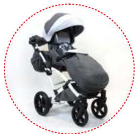
winter sleeping bag