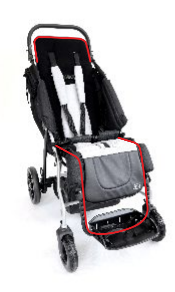
"I GROW WITH YOU" system allows to extend: - the seat depth up to 45 cm - backrest height up to 85 cm (tools required) Designed to adapt and evolve!

Reducer cushions set consisting of 4 independent velcro pads offers an additional adaptation of the seat interior through simple attaching of the pads at desired position. Easy adjustment of seat width and depth at your fingertips.