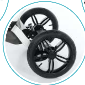
SHOCK ABSORBERS FOR WHEELS CENTRAL BREAK DIRECTIONAL LOCK OF FRONT WHEELS