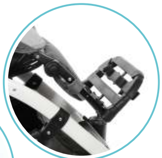
FOLDING AND ADJUSTABLE FOOTREST