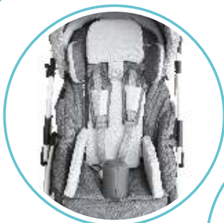
FIVE-POINT SAFETY BELTS ADJUSTABLE PADS REDUCER CUSHION