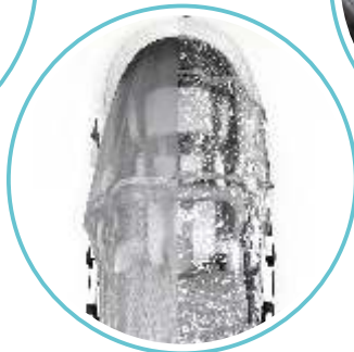
RAINCOVER MOSQUITO NET